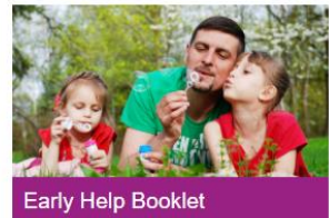
Early Help Booklet

Early Help in Worcestershire have created a booklet to help families find out about the help and support available in the county for children and young people aged 0-18 years old. The new booklet will help you and families find the most appropriate support.