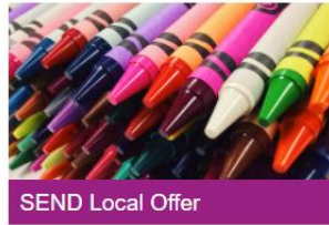
SEND Local Offer