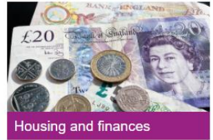
Housing and finances

The Online Family Hub has been developed to provide you with a range of different types of resources that are available to you online, on the phone or face to face that you can access directly.