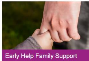
Early Help Family Support