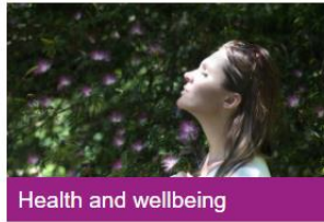
Health and wellbeing